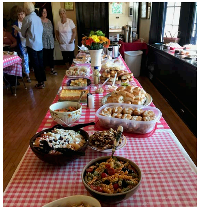
The ladies of the Porch Club hosted a picnic themed luncheon.