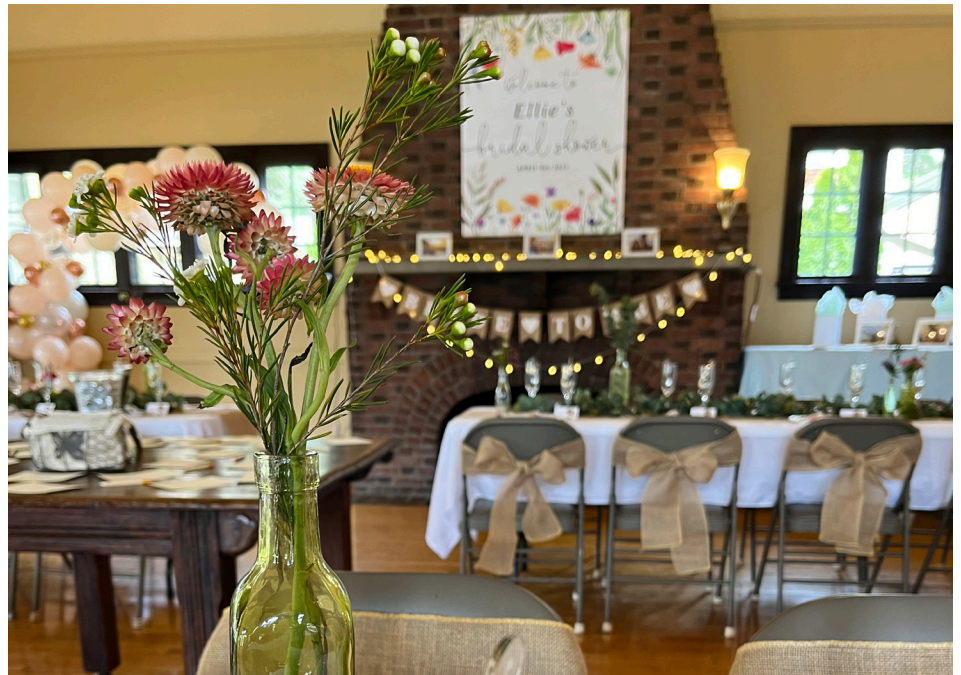
One of many beautiful ideas for renters to decorate the club for their event.

Our committee created an Idea Book so renters can share pictures of their events. Prospective renters visiting the club are excited to browse the binder and see the way decorations can transform the clubhouse. After their parties, renters are eager to provide us with photos. The Idea Book makes selling the rentals fun and rewarding!