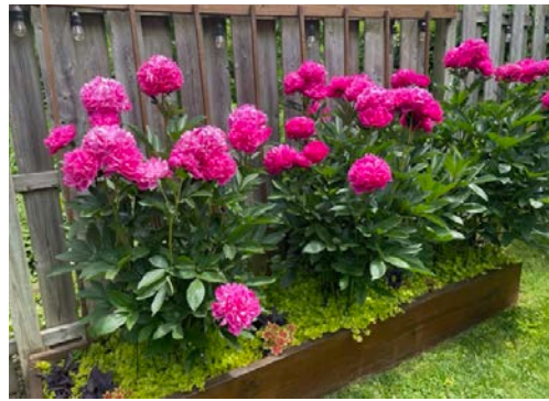
Phyllis Rodgers beautiful garden fountain (left) and her peonies