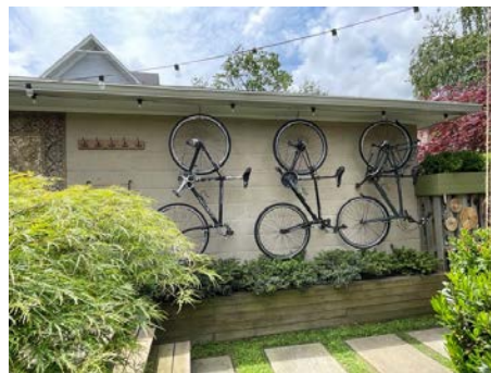
Adrienne Rogers bikes