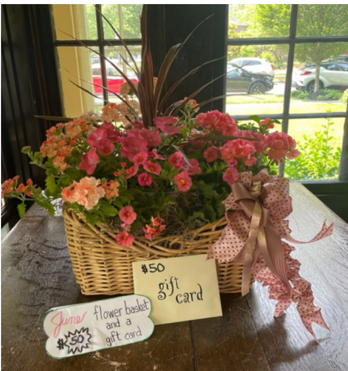
A beautiful raffle basket at the June luncheon